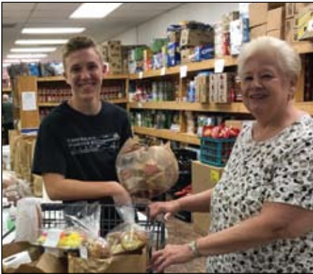
Cape Coral Caring Center’s pantry offers food for those with special dietary needs.

Just look at last year, when this partner agency of the Harry Chapin Food Bank provided 145 tons of food through its emergency pantry. While it assists with electric bills, clothing vouchers and job skills, giving food is 75 percent of what the center does. “And we give food very generously,”