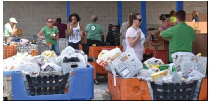
The bins were filled to overflowing as volunteers unloaded hundreds of thousands of pounds of food generously donated through the annual Letter Carriers' Food Drive.